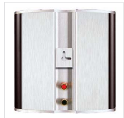
Integrated wall mount