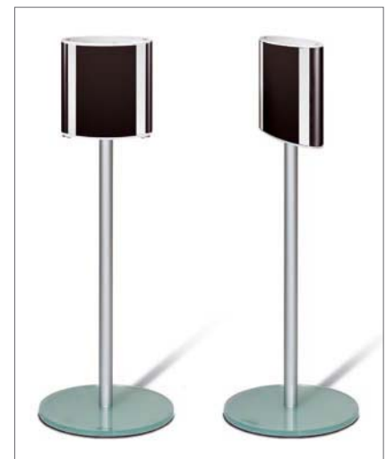
Optional available SIGNO STATIV